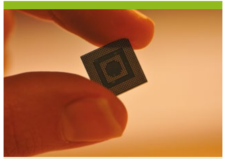
5G INTEGRATED CIRCUIT

Innovative embedded electronics New business models